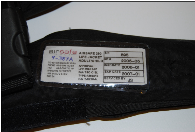
Pic 4. Label marking