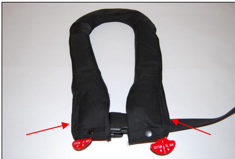
Pic 1. Inspect the 2 opening areas near both zipper ends.