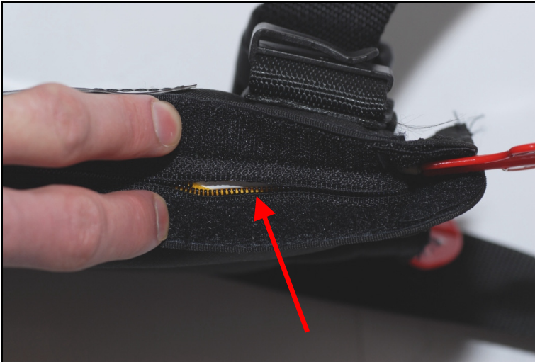
Pic 2. The zipper opening area is placed inside the Velcro close to the inflate handles.